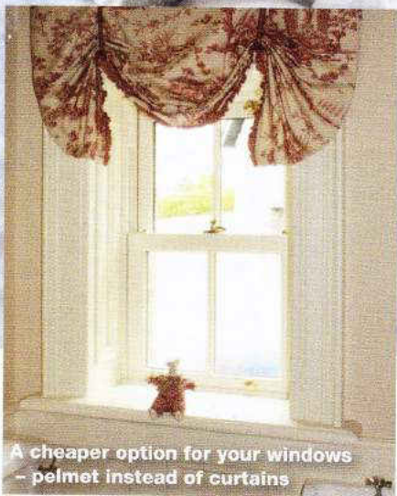
A cheaper option for your windows - pelmet instead of curtains